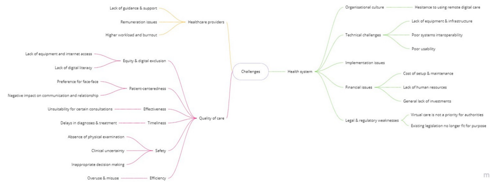
Fig 2. Conceptual map of main challenges identified.

https://doi.org/10.1371/journal.pdig.0000029.g002