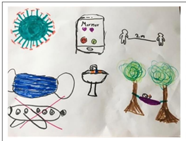
Figure 4. The text on the cell phone says 'grandmother'.

Covid-19 was described as a lethal disease; 'you can die from the virus if you are unlucky'. Children reported that people all over the world were dying from it and that different countries were affected in different ways. They told that it was mainly older people who died and should be isolated, and that the virus was of less or no danger to themselves or their parents if they were healthy and had no other underlying diseases; 'It is more dangerous for the elders and those with less resilience'.