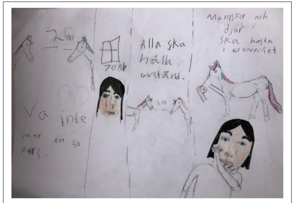
Figure 2. The text says, '2 meters distance', 'Do not gather in groups with more than 50 people', '[People over] 70 years [should be isolated]', 'everybody must keep distance', and 'People and animals must cough into the arm'.

Children raised thoughts and questions about why children do not get as sick as older people do, and also identified questions regarding if animals could be infected (Figure 2). They also wanted to know if they had had the virus, if infants could get sick, and if it is possible to prevent the virus from coming back: 'How to stop it?' Common questions were also raised about when the pandemic would end, when a vaccine would be