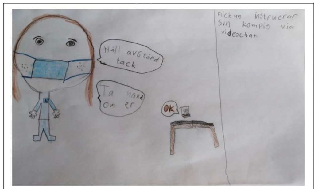
Figure 1. The girl instructs her friend through video chat, and the text says, 'keep distance, please' and 'Take care of yourselves'.

Information through reliable sources was reported as more calming than getting new information every day through a newscaster on TV (Figure 1); 'I would like information from my mum because she works with Covid-19 and a lot of other things in healthcare, so I trust that she knows her stuff.'