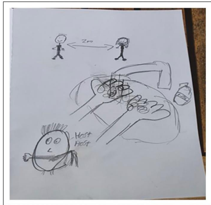
Figure 5. The text says '2 meter (distance)', 'soap' and 'Cough, cough'.

The findings of this study gave a glimpse into how Swedish children, aged 7–12 years, accessed and perceived information about SARS-CoV2 and Covid-19 during the first phase of the pandemic. Compared to other countries, where parents were the main source of information [8], it was clear that school significantly contributed to the Swedish children's knowledge about Covid-19. Paakkari et al. suggest that HL is improved by being a