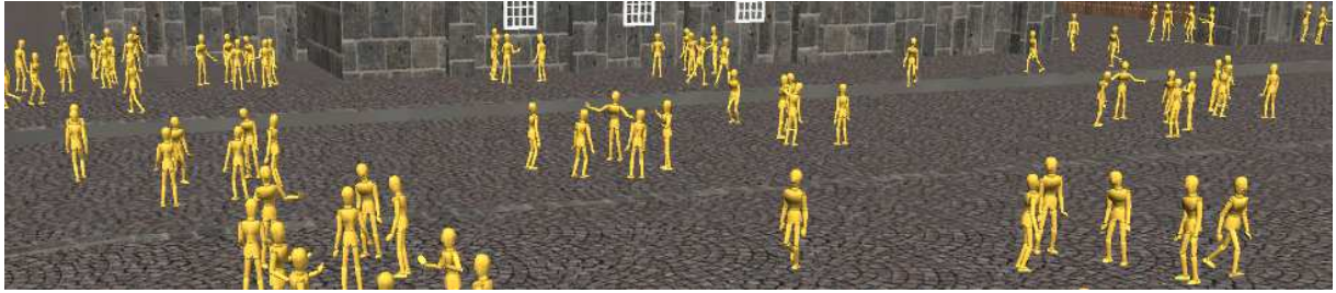
Figure 1: Androgynous mannequin models composing the virtual crowd.