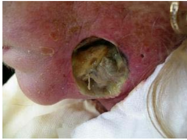
Case 1: Patient with significant medical co-morbidities and a complex defect.