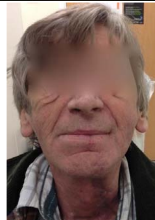
Case 4: Good aesthetic outcome following fibula free flap reconstruction of a Notani grade III defect.